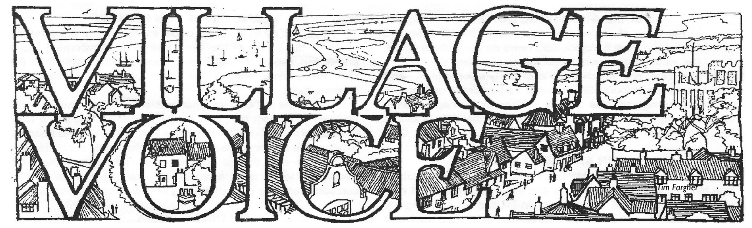
The newsletter for the community of Orford and Gedgrave